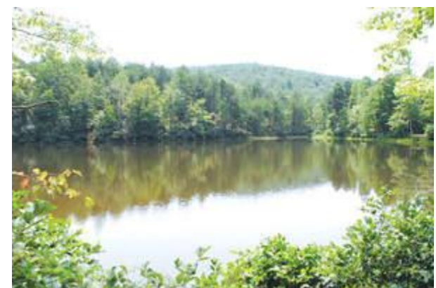
Turkeycock Mountain Wildlife Area offers the chance "to hunt, hike, and view wildlife from some of the highest elevations in the vicinity," according to the Virginia Department of Game and Inland Fisheries (DGIF) website. Scout Pond is shown above.

But few people use it, except during hunting season, according to Jason Gibson, longtime