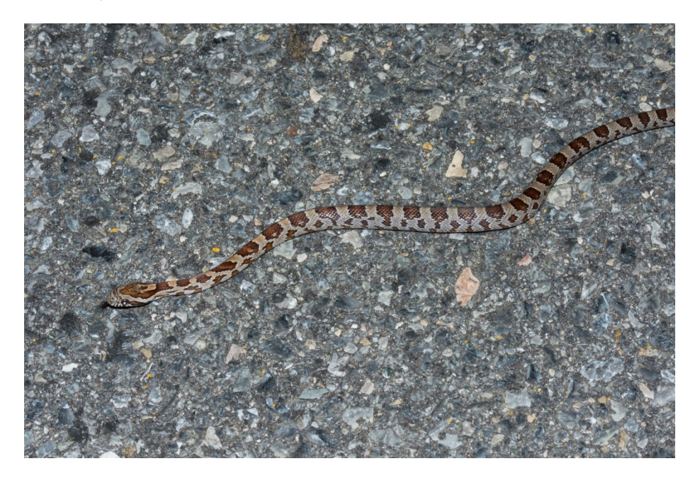
Lance H. Benedict 1918 Birch Rd McLean, VA 22101

On a May 2014 trip to Botetourt and Craig counties several Red Cornsnakes were encountered in Botetourt County within 5 km of the Craig County line. On a return trip on 26 June 2014, a 2013-cohort Red Cornsnake was observed crossing Route 615 approximately 400m into Craig County at 2115 h EST. The Red Cornsnake has not been previously documented for Craig County by Mitchell and Reay (1999. Atlas of Amphibians and Reptiles in Virginia. Special Publication Number 1, Virginia Department of Game and Inland Fisheries. Richmond, VA 122pp.) or the Virginia Herpetological Society (http://www.virginiaherpetologicalsociety.com/cgi-bin/herplist/action.php). A digital photograph of the specimen was submitted to the VHS archives (Archive#319).