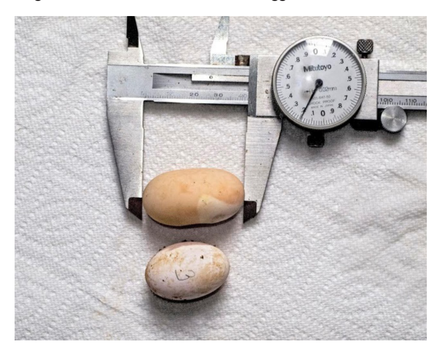
Figure 1. The largest egg known from a Woodland Box Turtle ( Terrapene carolina carolina ) in Virginia. One of the other normal-sized eggs in the clutch is included for comparison.

Terrapene carolina carolina (Woodland Box Turtle) VA: City of Richmond, 37.535089N, 77.526953W, 29 September 2014. Stephanie Foertmeyer.