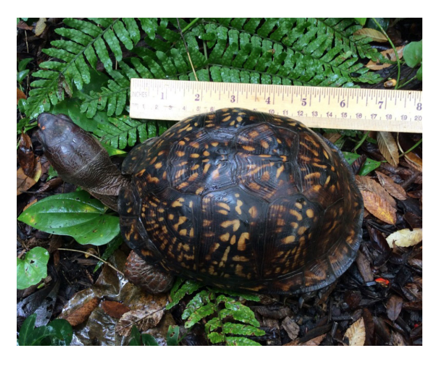
Figure 1. Largest known Woodland Box Turtle (Terrapene carolina carolina) in Virginia.