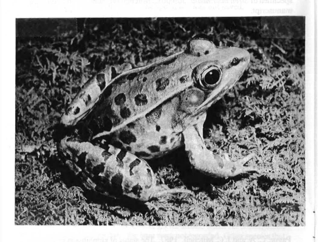
Rana sphenocephala from Fort Lee