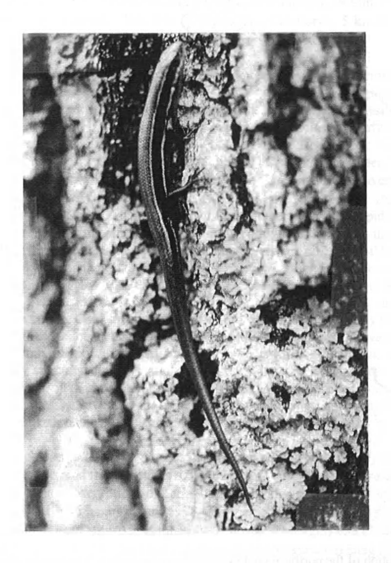
Adult female Eumeces anthracinus anthracinus from South Sister Knob, Bath County, Virginia