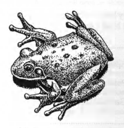
Hyla gratiosa mpp'98